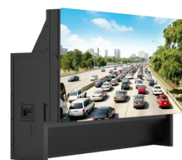
New Gen. LED Light